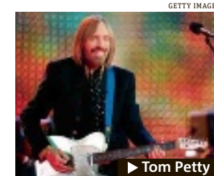
► Tom Petty

Tickets started appearing on Kijiji as early as Tuesday morning, with some sellers asking $1,000