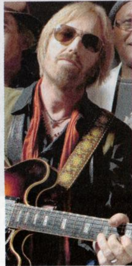
Tom Petty and his band the Heartbreakers are coming to the Halifax Metro Centre in late May or early June.