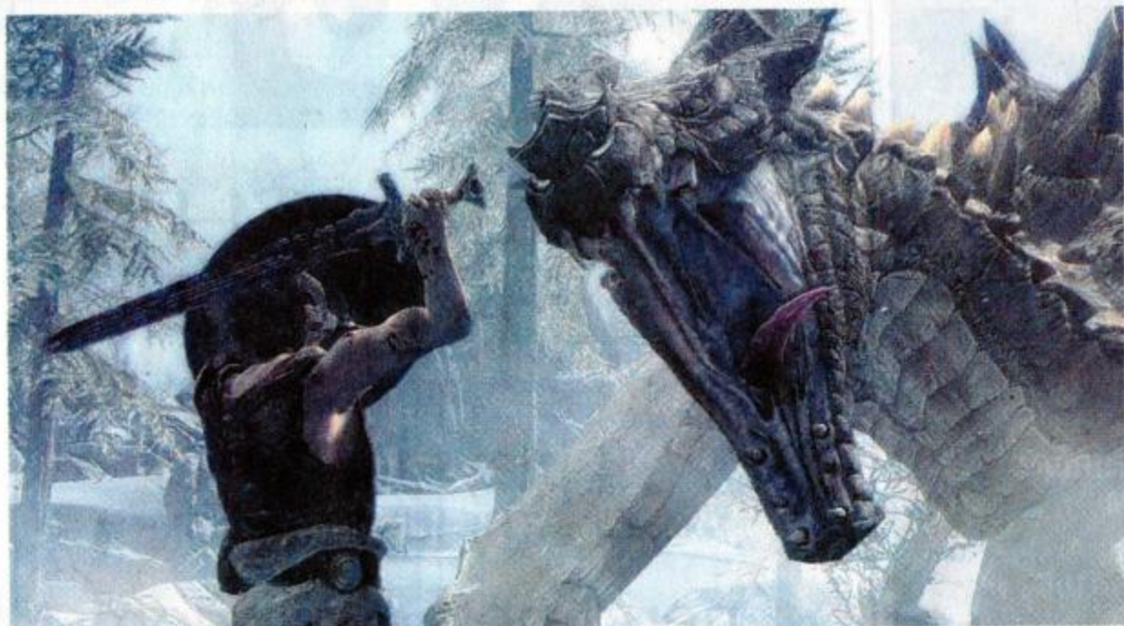
Skyrim is pure ambrosia for role-playing junkies who don't want any human contact.