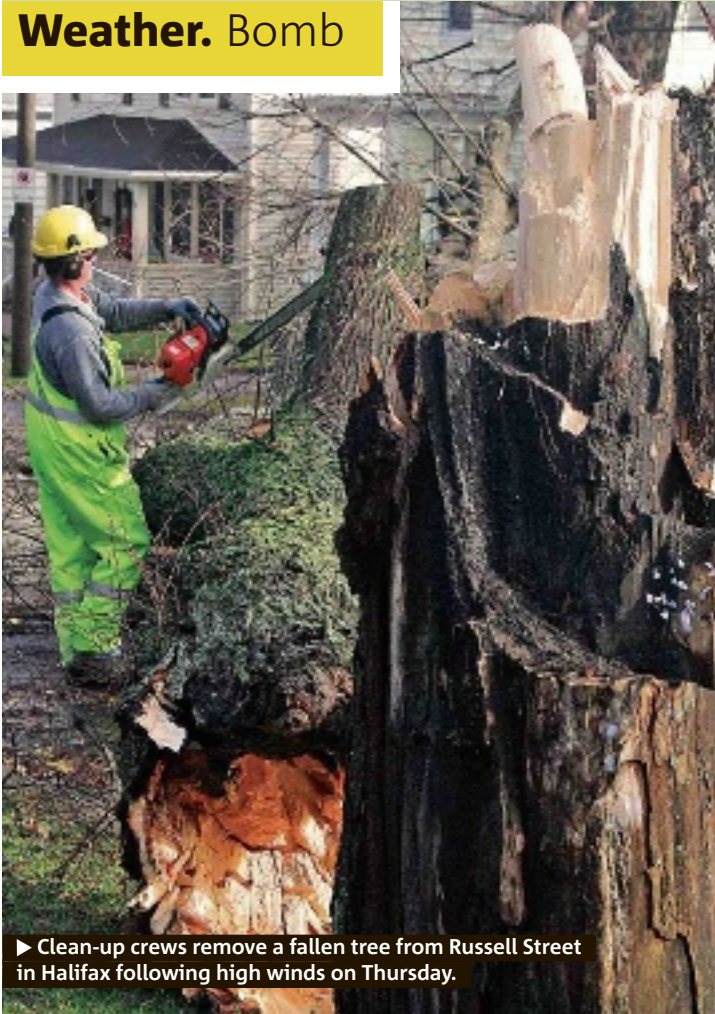
► Clean-up crews remove a fallen tree from Russell Street in Halifax following high winds on Thursday.