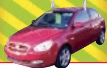
'08 Hyundai Accent Hatch $9,700**

ALL VEHICLES PRICED TO SELL! 2648 ROBIE ST