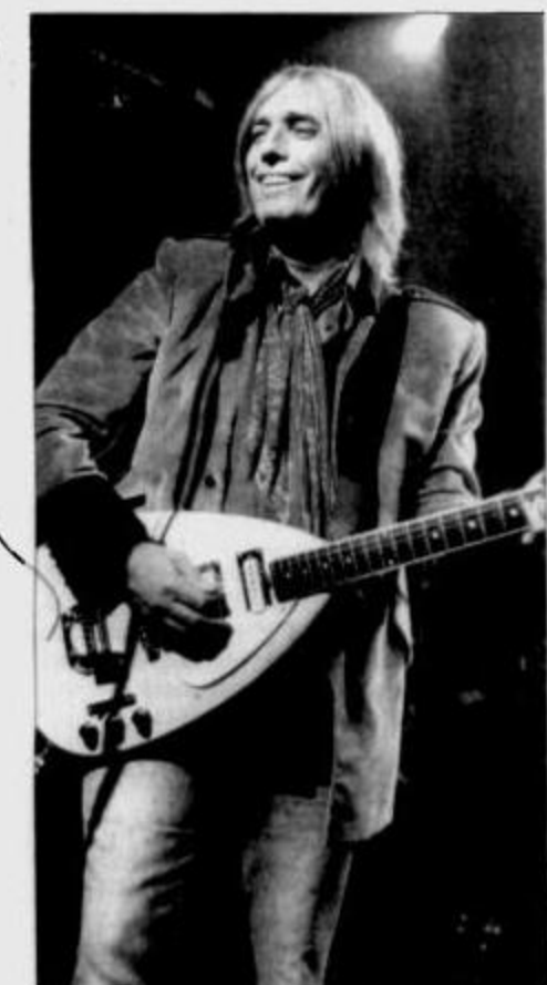
There's no denying that Tom Petty and his Heartbreakers have put out 30 years of great garage rock. But his best work has come when he has stepped out alone.

ROYAL PALM 20, (941) 727-7469 My Super Ex-Girlfriend (PG-13) 12:50, 3, 5:10, 7:25, 9:45. Clerks II (R) 12:15, 2:25, 4:40, 7, 9:30. Monster House (PG) 12:30, 1, 1:30, 2:50, 3:15, 4, 5:10, 5:30, 7, 7:20, 7:45, 9:20, 9:40, 9:55. Lady in the Water (PG-13) noon, 12:45, 2:30, 3:15, 5, 5:45, 7:30, 8:15, 10. Pirates of the Caribbean: Dead Man's Chest (PG-13) 11:30, noon, 12:30, 1:45, 2:40, 3:15, 3:40, 5, 5:50, 6:30, 7, 9, 9:45, 10:10. Little Man (PG-13) 12:30, 1, 2:50, 3:20, 5:10, 5:40, 7:30, 8, 9:55, 10:15. You, Me and Dupree (PG-13) 1:30, 4:15, 7, 9:30. Superman Returns (PG-13) noon, 3:15, 6:30, 9:45. Devil Wears Prada (PG-13) 1, 3:25, 5:50, 8:15, 10:40. Click (PG-13) 1:30, 4:15, 7:10, 9:30. Cars (G) 1, 4, 7, 9:40. Lake House (PG) 1:15, 4:15, 7:15, 9:40. Nacho Libre (PG) 12:50, 3:10, 5:20, 7:40, 10. Over the Hedge (PG) 1:45, 6:45. Waist Deep (R) 4, 9:30.