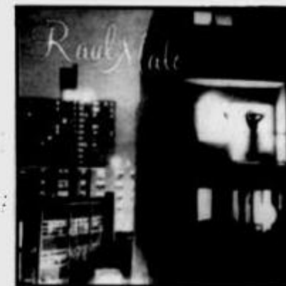
Raul Malo, You're Only Lonely (Sanctuary) GRADE: A