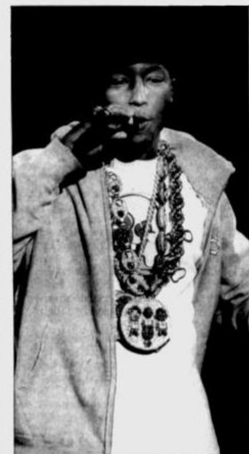
Pharrell wrote and produced his new album, In My Mind , almost entirely on his own, an unheard-of feat in pop music.