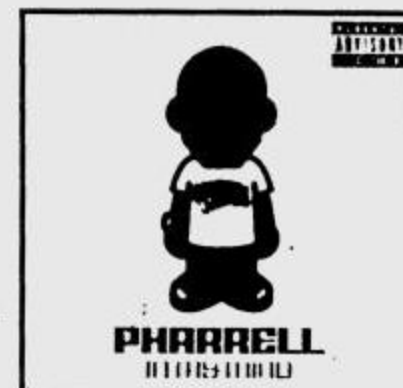
Pharrell, In My Mind (Star Trak/Interscope) GRADE: B+