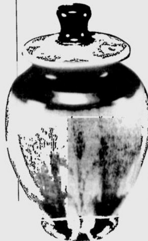
The Thomas Center Regional Juried Exhibition opens with a reception today at 5 p.m.

NATURE'S FINEST: Some of the occurrences we see in nature continue to astound us right down to the deepest recesses of our being, such as the Everglades, or the Grand Canyon, or Donald Trump's hair. Eighteen artists will display works focused on nature in the new exhibit "Natural Curiosity: Artists Explore Florida" at the Florida Museum of Natural History.