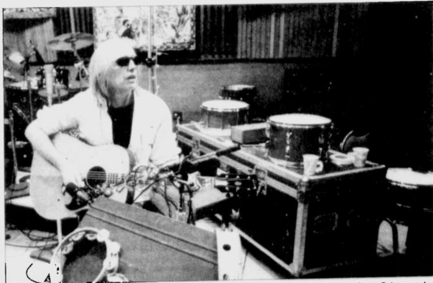
Tom Petty and the Heartbreakers will perform at the Ford Amphitheatre at the Florida State Fairgrounds in Tampa on Friday.