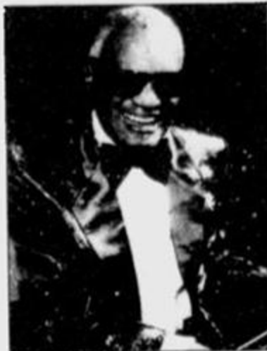
R&B icon Ray Charles grew up in North Florida and attended the State School for the Blind in St. Augustine. Top: Gloria Estefan may be the most successful contemporary singer to meld Latin and American sounds.

For sheer quirkiness, nothing tops the exhibit better than bits of Morrison's eclectic history in Tallahassee. There's a police mug shot and a 1963 arrest record for drunk and disorderly behavior. And the door, of course, with peeling pink paint.