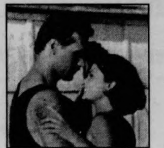
LATINO FAMILY VALUES see page H2

UCSD GUARDIAN ARTS & ENTERTAINMENT MAY 4, 1995