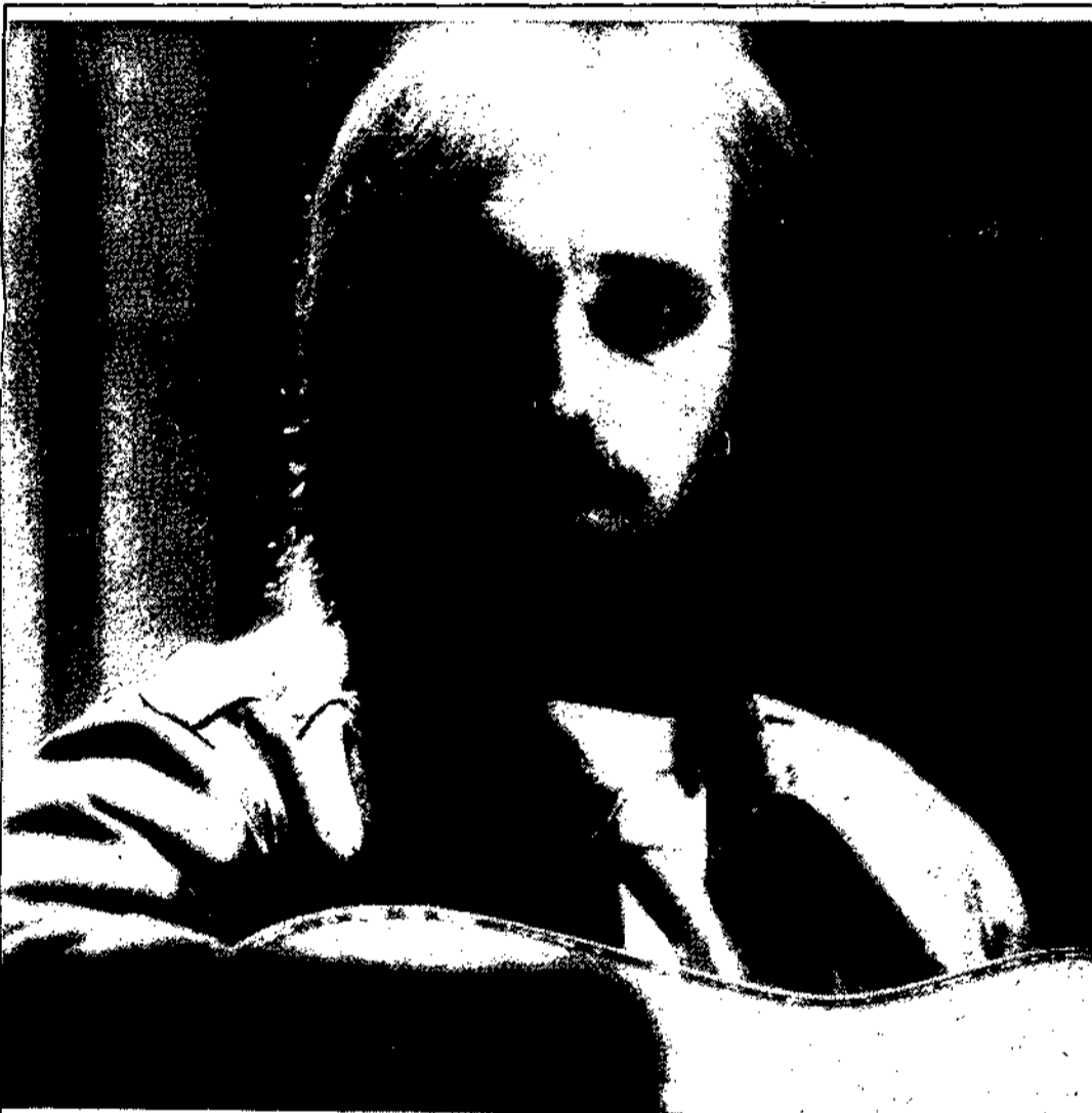
Tom Petty's newly released album, Wildflowers, is a hit.

The list goes on and on. Wildflowers is quite simply good music that will someday become vintage. I suggest giving Wildflowers a "test drive" if you haven't already. If you liked his last album, you'll most definitely love Tom Petty's Wildflowers .