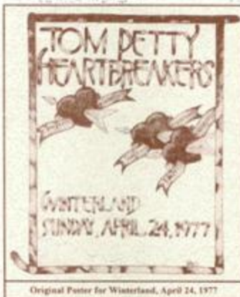
Original Poster for Winterland, April 24, 1977

Writers would echo those words repeatedly over the many years to follow. In an article dated March 1, 1995 from the (Louisville) Courier-Journal , the band's 1995 opening night show was described, "... By the second song, the sold-out house was singing every word along with Petty and his Heartbreakers ... Petty's every gesture was rewarded with cheering that bordered on rapture ... Petty and the Heartbreakers earned it all, and not just with their performance, which was a thing of beauty. Last night's crowd was also cheering Petty just for being Petty."