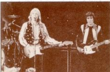
Tom Petty & the Heartbreakers on Midnight Special , 1978. L - R: Tom Petty, Ron Blair