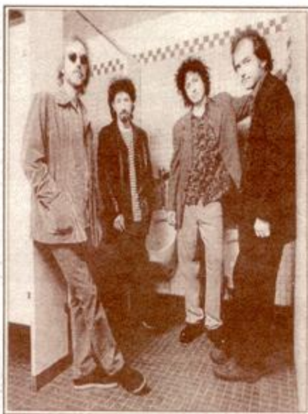
Tom Petty and the Heartbreakers, 1995 L - R: Tom Petty, Howie Epstein, Mike Campbell, Benmont Tench

With a pronouncement from Tom, "Here's one for all you sweet little honeybees out there," the guys