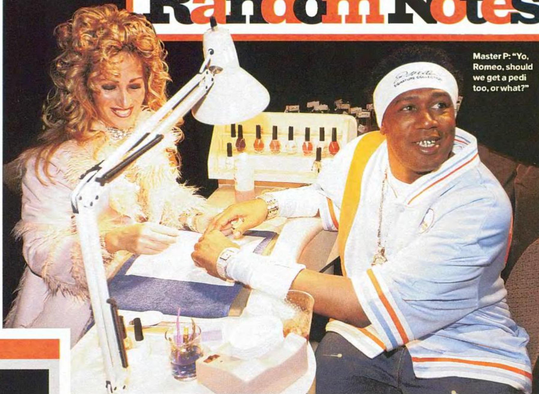
Master P: "Yo, Romeo, should we get a pedi too, or what?"

The Vancouver faithful who turned up to see Seattle roots-rock band the Minus 5 got a special treat: the world premiere of a brand-new R.E.M. song, "Weatherman." In town to work on their next album (be patient — it won't be out until 2004), guitarist Peter Buck and bassist Mike Mills had been sitting in with the Minus 5 when Michael Stipe got onstage for the up-tempo rocker. The crowd loved it, but Stipe wasn't completely satisfied. "I couldn't hear myself, because I still had my earplugs in from the Minus 5 set," Stipe said afterward. "Stupid fucking idiot."