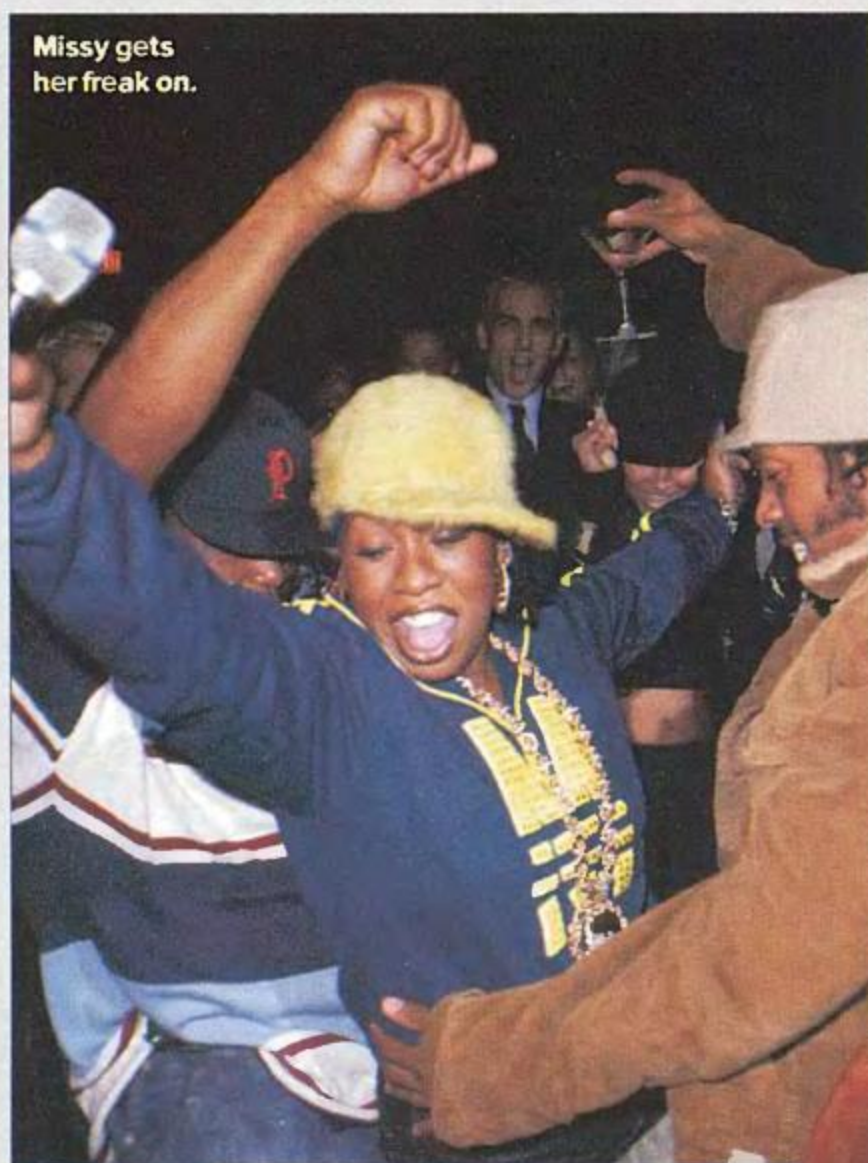
Missy gets her freak on.

● Johnny Knoxville, Christina Aguilera, Mos Def, Ludacris, Christina Ricci, Black Eyed Peas and others checking out Missy Elliott's Motorola party set at the Lot, in Hollywood.