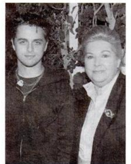
Green Day's Billie Joe Armstrong, left, visits with Marilyn Bergman, ASCAP president/chairman of the board, following the awards ceremony. Green Day scored an award for its song "When I Come Around."