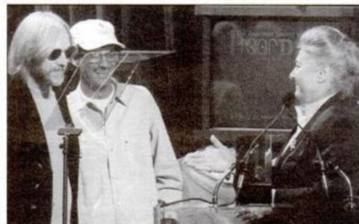
Tom Petty, left, receives ASCAP's Golden Note Award for his "enduring place in contemporary American music" from producer/Interscope president Jimmy Iovine, center, and Marilyn Bergman, ASCAP president/chairman of the board.