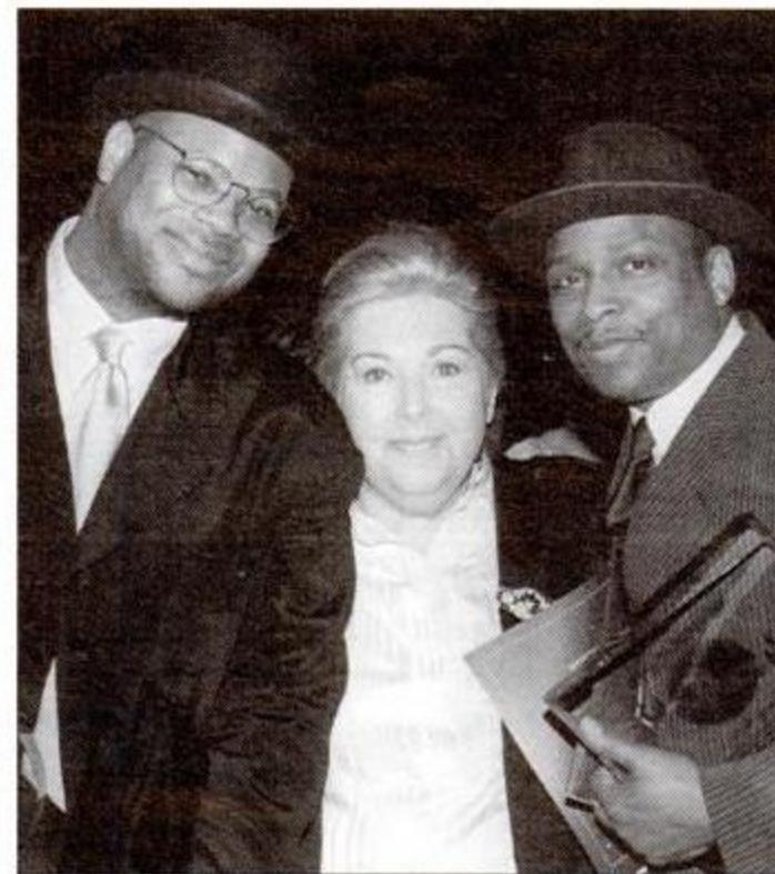
Marilyn Bergman, ASCAP president/chairman of the board, is flanked by Jimmy Jam, left, and Terry Lewis, who picked up the ASCAP song of the year award for "On Bended Knee." The song was recorded by Boyz II Men and published by Flyte Tyme Tunes/EMI Music Publishing.