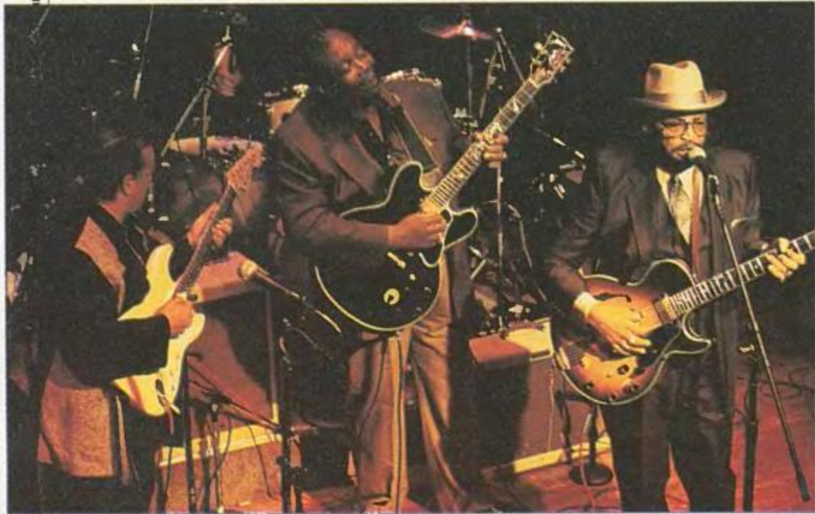
Steve Cropper, King and Lowell Fulson pay tribute to Dixon (from left)

T here goes the neighborhood. Yes, IGGY POP has moved in on Nickelodeon's The Adventures of Pete and Pete , a show about two suburb-dwelling brothers. Pop hilariously plays what he calls "a boomer dad with a corn cob up his ass." "It's fun," he says. "The little Pete had me sign Fun House . I was real happy. I felt stupid because I put the f word on it, but he's 12, so I wrote f and a line. I said, 'That's a curse.' He said, 'I know! God!'"