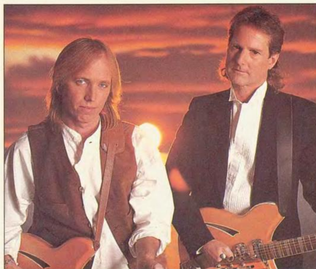
TOM PETTY ON ROGER MCGUINN

"We were awestruck when we met Roger. I was in L.A., and somebody told me that Roger wanted to see me. I came in, and he said, 'Pick up that guitar and play.' Scared the shit out of me. Then he said, 'I really did think it was me when I heard 'American Girl.'"