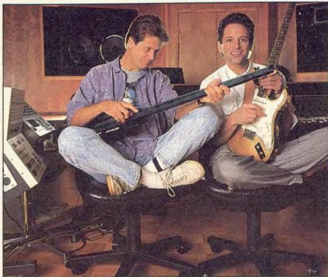
LINDSEY BUCKINGHAM ON BRIAN WILSON

"His music always had the quality of lifting the spirit in a way that transcended his subject matter. Brian decided his music was about his own growth rather than just about selling records. Having been part of a machine that was often dedicated to cranking out hits, I appreciate what it took for him to make that choice."