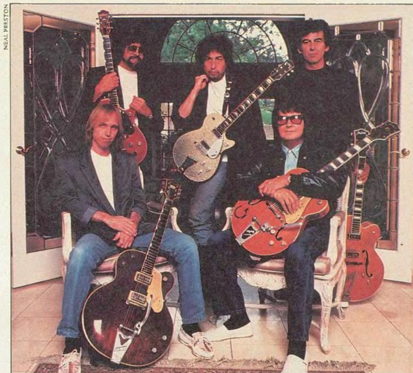
We are family: The Traveling Wilburys, featuring Charlie T. Jr., Otis, Lucky, Lefty and Nelson (from left)

So what's a Wilbury? According to the album's liner notes, the Wilburys are members of "a remarkable sophisticated musical culture" that developed without the aid of managers or agents. The name itself was the brainchild of Harrison and Lynne. "It's a legendary family," says Orbison. Each member has his own moniker: there's Nelson (Harrison), Lucky (Dylan), Lefty (Orbison), Otis (Lynne) and Charlie T. Jr. (Petty). Otis and Nelson produced the extraordinary album, titled Traveling Wilburys . The Wilburys have no plans to tour, but a movie is in the works. "The whole story of the Wilburys will unfold," says Orbison.