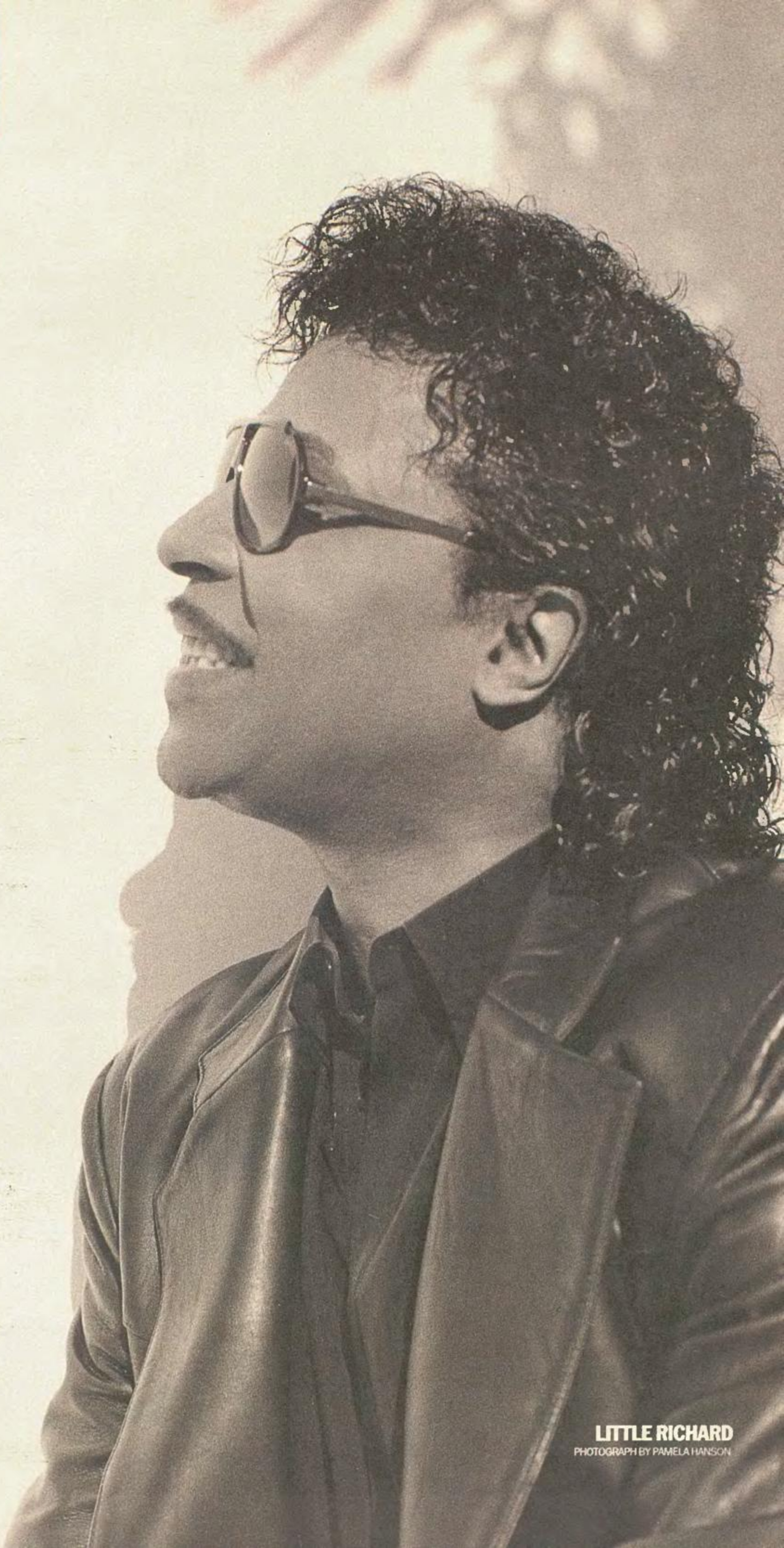
LITTLE RICHARD