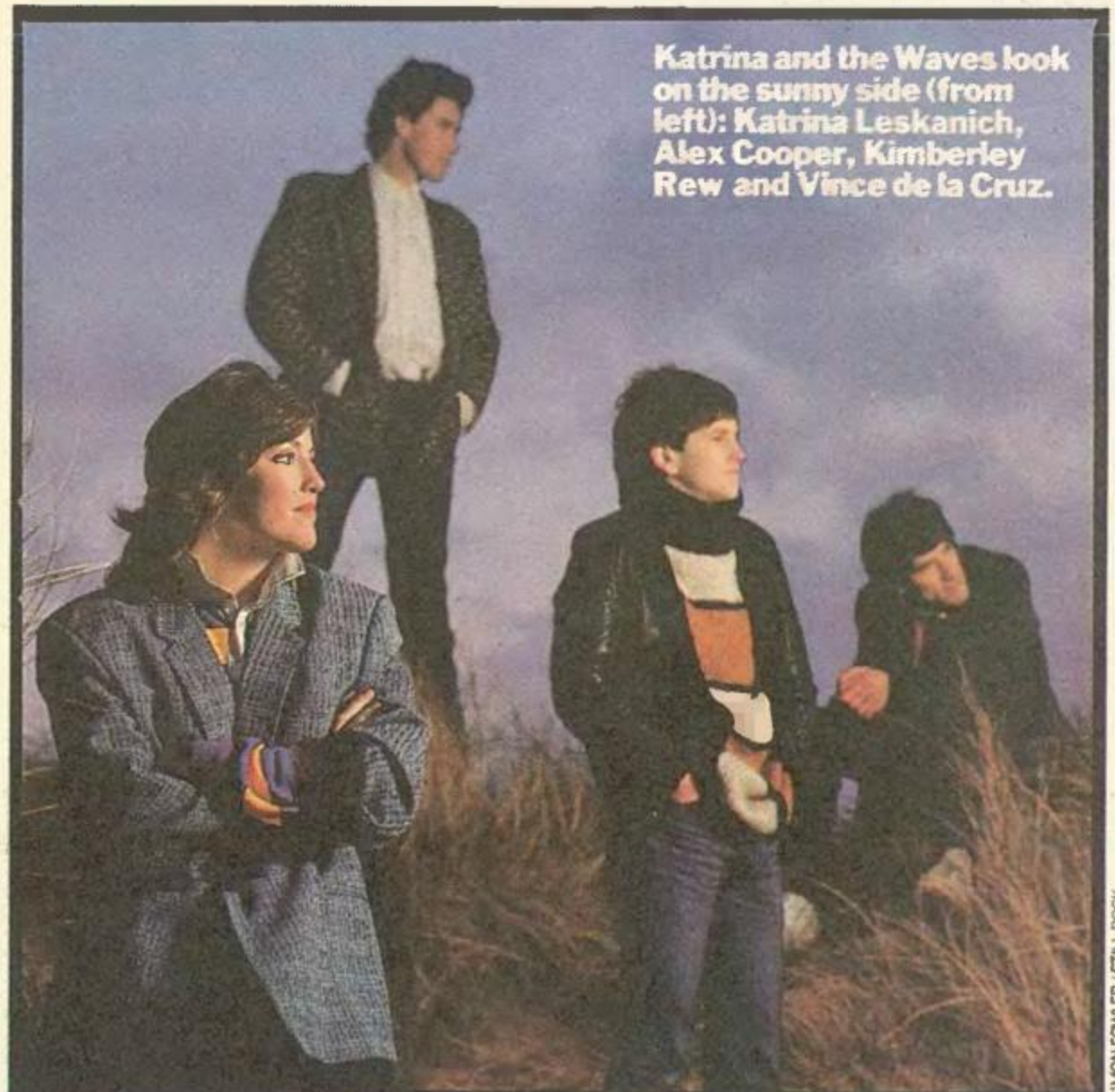
Katrina and the Waves look on the sunny side (from left): Katrina Leskanich, Alex Cooper, Kimberley Rew and Vince de la Cruz.